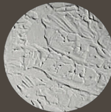
Slap Brush Knockdown